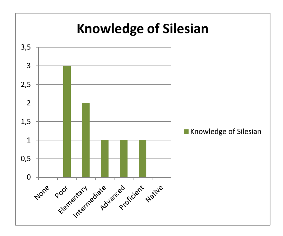
Fig. 3 Responders' knowledge of Silesian.

Most responders identified themselves as Silesians, although the purpose of the question was not to specify their national identity, rather their "attitude" towards Upper Silesia. Currently, identyfying oneself as a person of Silesian nationality is becoming more and more popular, as shown by the latest census from 2011. However, since my thesis does not have any political backgroud, I decided to drop any questions which may have political connotations. One respondent identified himself/herself as a Polish person who came to live in Silesia, and one respondent defined himself/herself as a guests whose stay in the area is only temporary.